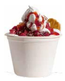
Sauces & Toppings