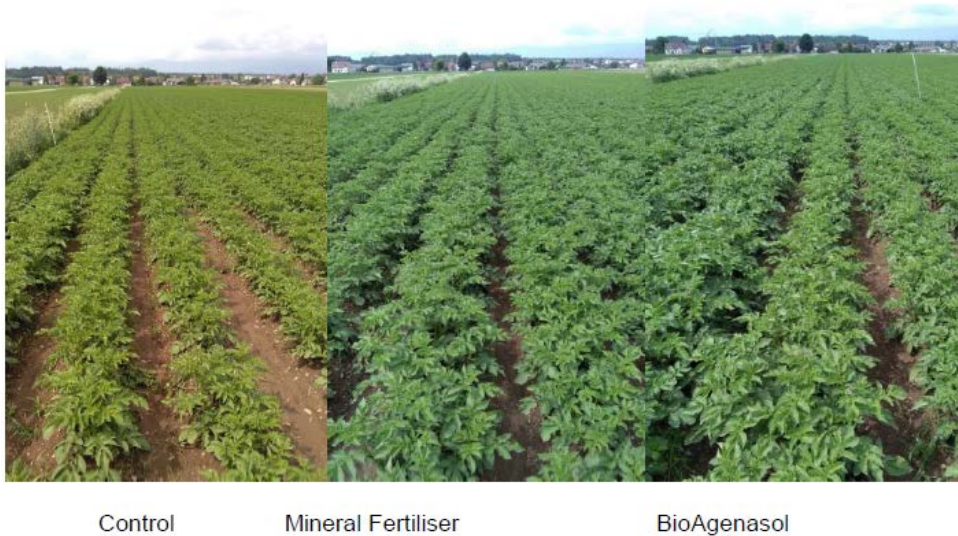
Fig. 2: Various variants of fertilizers on 22 May 2018.

The total soil examination showed that phosphorus is in the range C and potassium in the range D. This corresponds to a good nutrient supply. The pH was 6.3 in the weakly acidic range. The humus contents were in the middle range, with BioAgenasol® reaching a humus increase of 0.2%. The nitrogen supply potential was also in the middle range. Particularly striking here was a rapid drop in nitrogen supply potential for the mineral fertilizer variant in the low range (<35 mg N / 1,000 g fine soil).