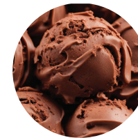
Preparations Fruit and Indulgent flavors