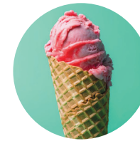
Compounds 4:1, 7:1, 7:3 Fruit:Sugar ratio