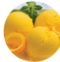
Fruit Purees & Puree Concentrates

Supporting product development with solutions as compound for the ice cream base: