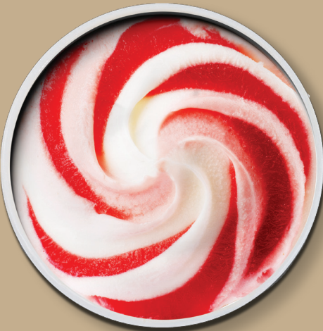
Swirls & Variegates