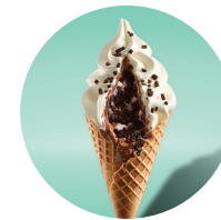
Liquid Core Fillings