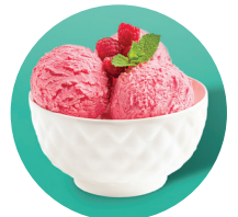
Sorbet Bases All-in-one solutions