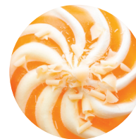
Swirls & Variegates